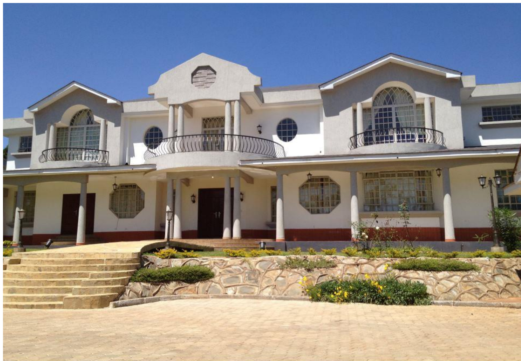
Former Chief of Staff of the SPLA Paul Malong's home in Nairobi, within Nyari Estate.

Kenya's investigative legwork could start at these locations and determine whether they were purchased with the proceeds of corruption. Kenyan investigators could obtain the real estate directory, sale documents and origin of the payments. With support from NGOs, domestic banks and US law enforcement, Kenya — East Africa's banking capital and home to a large South Sudanese diaspora — is well-placed to take the lead in pursuing potentially corrupt assets.