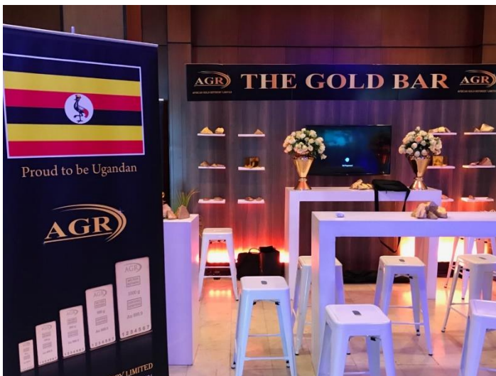
According to 2018 US Securities and Exchange Commission filings, AGR may be in the supply chains of 103 US publicly traded companies, including GE and Halliburton. Kampala, Uganda, October 2018.

The flow of gold to the Tony Goetz NV apparent affiliate company is important because Tony Goetz NV likely sells directly or indirectly to major U.S. corporations. It was listed as potentially being in the supply chain for 283 publicly listed companies in the United States, including Amazon, Sony, and GE, according to 2018 U.S. Securities and Exchange Commission filings. 233 Furthermore, AGR itself is listed as potentially being in the supply chain for 103 publicly traded companies in the United States, according to the same filings. 234 This raises the question of whether conflict gold is entering major U.S. supply chains.