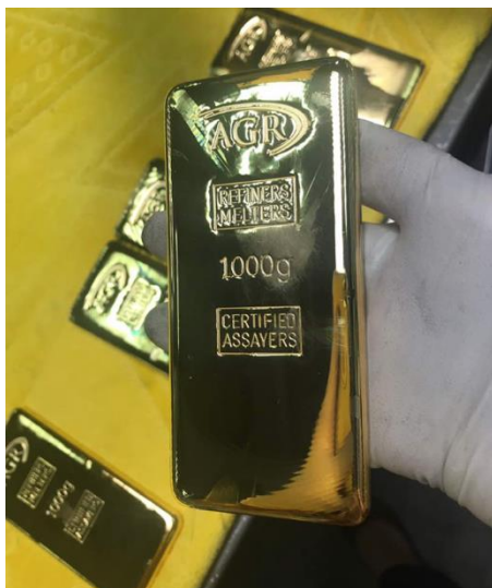
In 2017, according to documents reviewed by The Sentry, AGR exported 9.3 tons of gold, although the company says it exported 7.3 tons. Both figures are far beyond Uganda's domestic production, and AGR acknowledges sourcing from Congo.