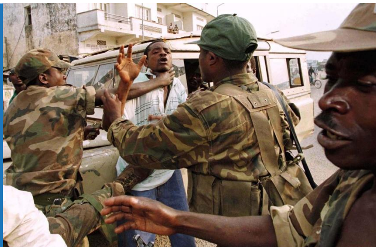
AFDL rebels, March 1997.