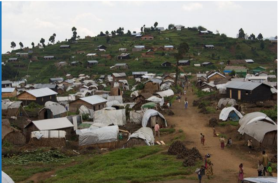
Photo: Kitchanga displaced persons camp, North Kivu, Congo.

According to the UN, 4.5 million people are displaced in Congo at present as a result of conflict, and conflict gold provides the largest source of revenue to armed actors in the conflict in eastern Congo.