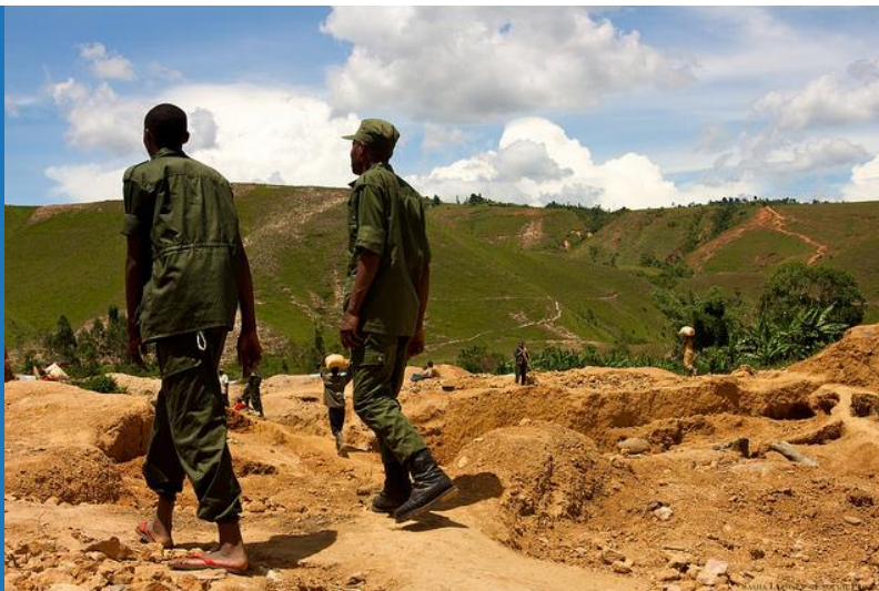
Photo: Congolese Army soldiers at a gold mine in South Kivu, Congo.