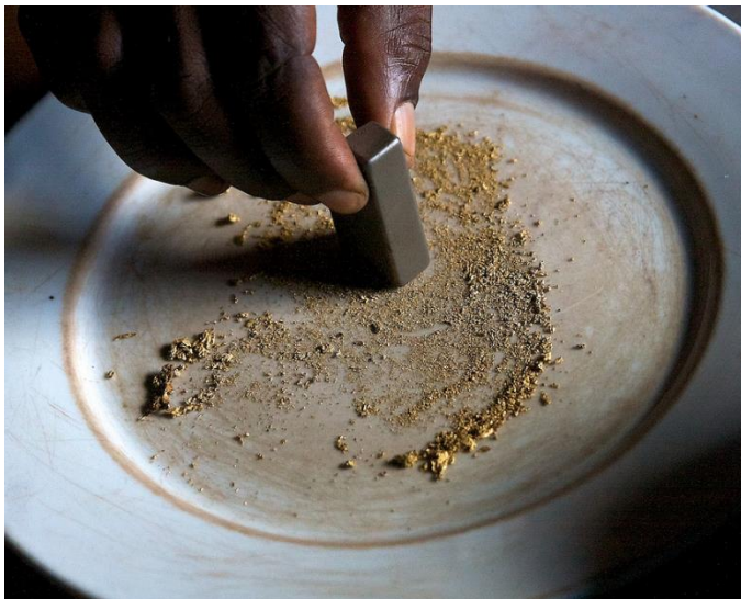
Gold from various sources in eastern Congo is reported to be typically mixed together by trader/smugglers or export houses in Bukavu and Butembo before it is exported.

the U.N., and donor representatives may be legally exported. 129 AGR says that it also sources from Uganda, Rwanda, Kenya, and Tanzania and that it does not contribute to conflict financing. 130